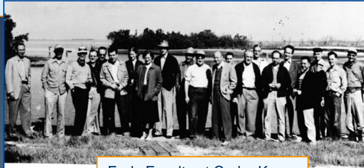
Early Faculty at Cedar Key.