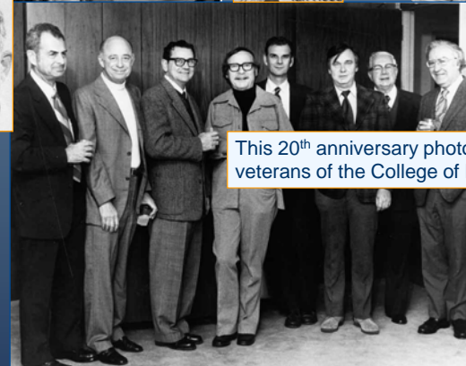
This 20 th anniversary photograph shows 20 year veterans of the College of Medicine.