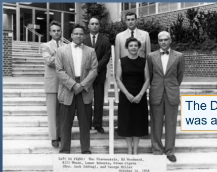
The Department of Surgery in 1958. Anesthesiology was a division of Surgery at this time.