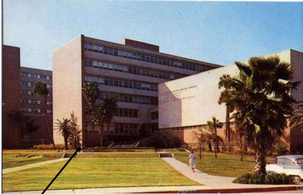
Location of the cornerstone.

The original capsule was planted in March of 1955. It was sealed into the cornerstone of the Medical Science Building. At the time, the cornerstone was on the outside of the building, on the north side and was by one of the major entrances to the building.