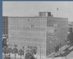
Jacksonville hospitals also trained residents beginning in the 1920s.

Nurses could receive some training in Florida. There were hospital training programs, such as the one pictured at Brewster Hospital in Jacksonville, and programs at Universities such as FSU and FAMU. FAMU's program was originally hospital based, becoming the first program in Florida to offer a baccalaureate in nursing in 1936.