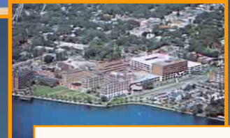
St Vincent's Hospital

The city of Jacksonville has long been a center of health care in Florida. The Duvall County medical society formed in 1853 and was actively engaged in health care and public health efforts in the city. The State Board of Health was centered in Jacksonville and its library was said in 1953 to be the largest in the country. Jacksonville physicians were among the most active in campaigning to bring a medical and dental school to the state. The city also was the home for a large number of hospitals, including one for the African American population, a children's hospital and, briefly, a special hospital ship for treating venereal disease. The presence of so many hospitals, especially the Duvall County Hospital, made possible early residency training. Jacksonville began to train residents in 1927.