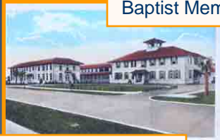
St. Luke's Hospital